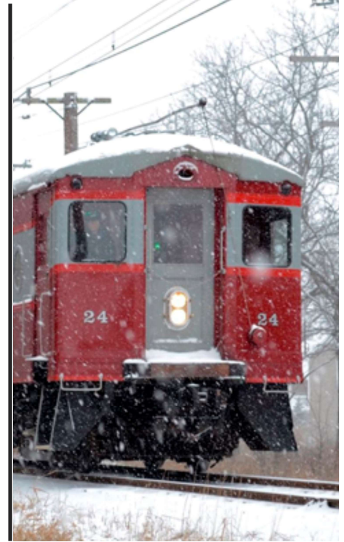
Historic Electric Rails of Wisconsin

05/29 Wed 7:15 am-7:15 pm 9373 Fee: $105 Res: $100 KA: $99 Departs Community Park Softball Lot Check Payable to: CET